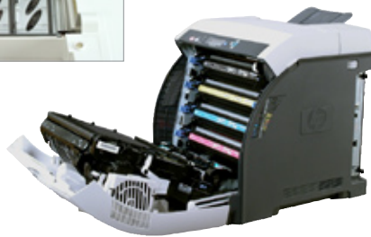
HP Color LaserJet CP3505