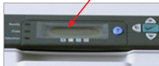
HP Color LaserJet CP3505

6-line display, complete with animations