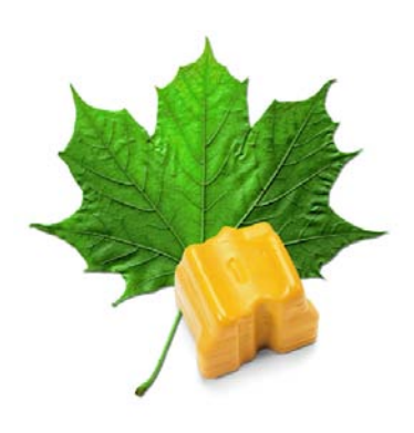
Solid ink is earth-friendly. It generates 1/40th the waste of a typical color laser device.