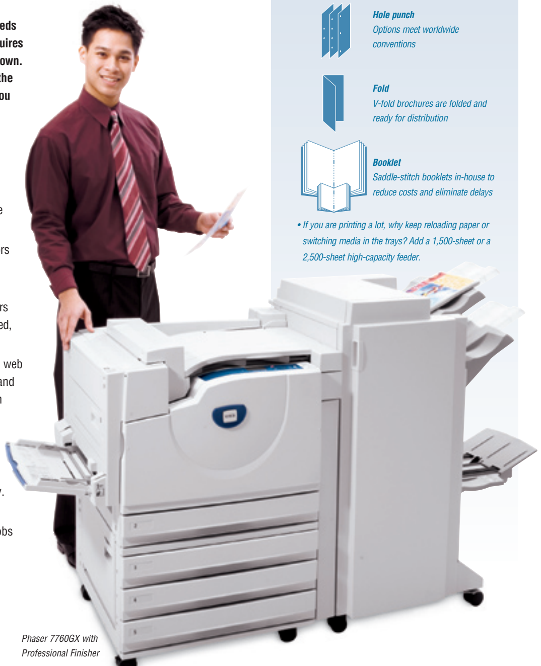
Phaser 7760GX with Professional Finisher