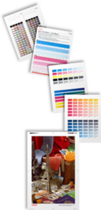
Built in color calibration tools give you the final output you want.

High-quality, consistent color is crucial when you rely on stunning visuals to convey your ideas and concepts. That's why the Xerox Phaser 7760 color printer is the designer's choice. It offers brilliant color, blazing speeds and easy-to-use features that make the most of everything you print.