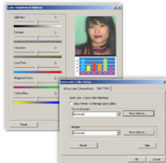
Advanced Color tools allow you to fine-tune output to your specifications.